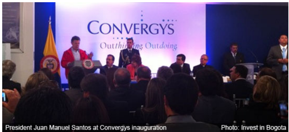
President Juan Manuel Santos at Convergys inauguration